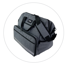
AN EMBLEMATIC SILHOUETTE